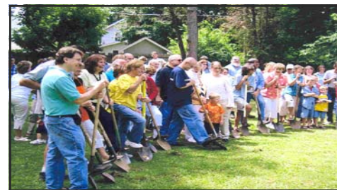
Committee members, community leaders, family, friends and neighbors dig in..