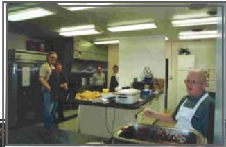
Columbiaville United Methodist Church hosted a spaghetti dinner to benefit Lapeer Habitat. A local success, this dinner brought both community and financial support to Habitat.