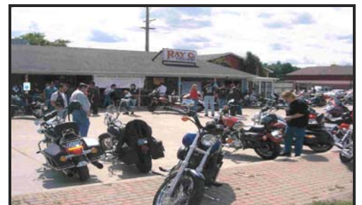
Bikes and Classic Cars met at Ray C's of Lapeer on Sunday, August 7th to raise money for Lapeer Habitat. Ninety-one people entered the poker run, sponsored by Ray C's, with prizes donated by AAA Insurance of Lapeer.