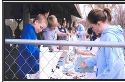
The St. Paul Lutheran Church Youth Group built birdhouses for Habitat during their 30-hour fast on Saturday, April 17th. The birdhouses were later sold with the proceeds going the Lapeer Habitat. Look for the unsold birdhouses along the Polly Ann Trail!