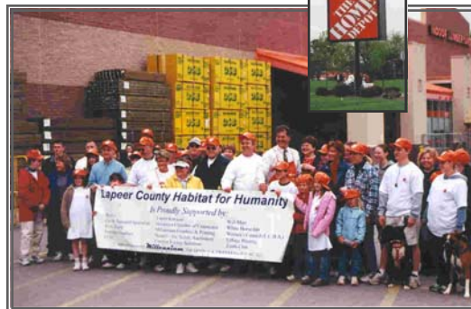
Participants in Lapeer Habitat's Walk for Warmth raised pledges prior to walking four miles on May 15th.